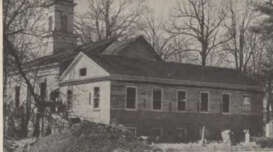
ST. STEPHEN'S, Armonk, new parish house rapidly approaches completion. Picture taken first of May.