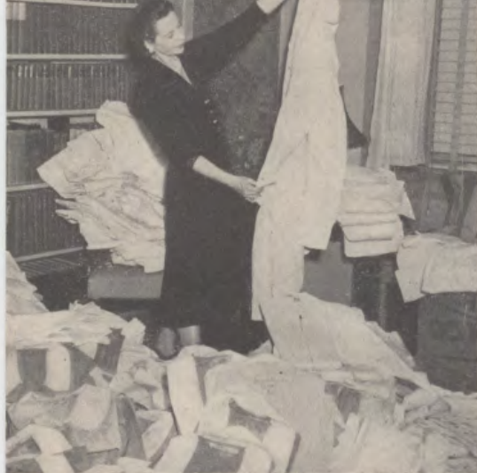
A member of St. Stephen's, Manhattan, examining used nurses' uniforms for St. Luke's Hospital, Tokyo.